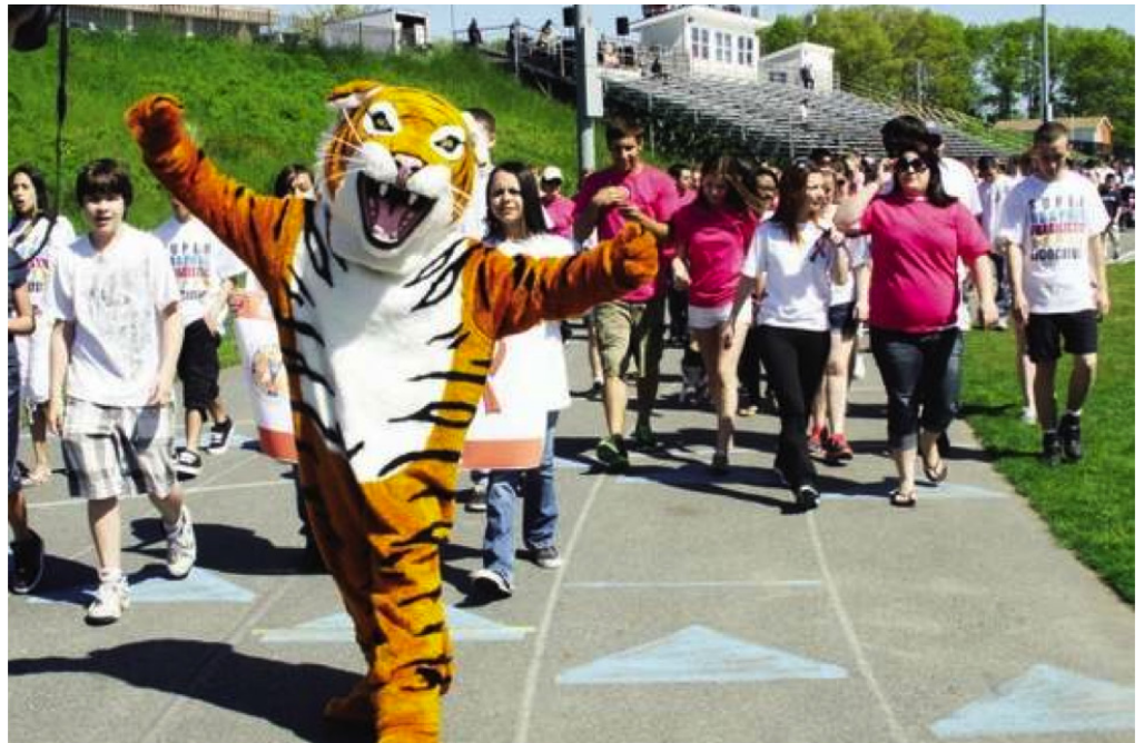
Boomer the Bengal leads participants on the first lap around the track at the "Stomp Out Cancer" Walk at Diman Regional on May 2nd